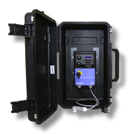
Frequency converter to control the Grundfos MP 1 pump

All information contained in this brochure is of a provisional nature. We retain the right to amend equipment, procedures and specifications.