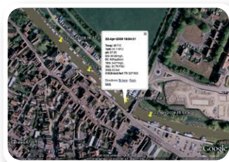
GPS data sets viewed in Google Maps and Google Earth