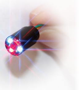
Optical DO sensor LED's flash during measurement.

The AP-2000 has a factory installed and fully calibrated optical DO sensor. The sensor requires much less maintenance than the galvanic version, gives more stable readings and requires cap changes only once every 2-3 years.