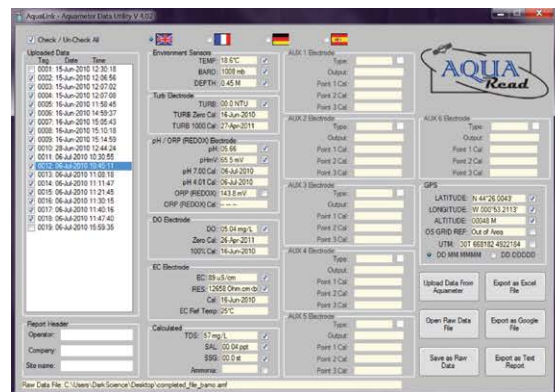
AquaLink and Google Earth screen shots