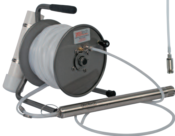
Portable Bladder Pump Reel System (shown with 1.66 Pump)